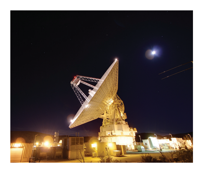
The Goldstone Deep Space Communications Complex, located in the Mojave Desert in California, is one of three complexes that comprise NASA's Deep Space Network (DSN).

Images from NASA's Chandra X-ray Observatory – a telescope in orbit around the Earth that looks at objects in space in a special type of light called X-rays –can be fascinating, informative, and beautiful. These images show our Universe in a way we could never see directly with human eyes. But the information that is eventually converted into images actually arrives at the Chandra X-ray Center in Cambridge (USA) as a stream of 1's and o's that only a computer could understand. Fortunately, many people have worked hard to develop steps to process the data using software and technical know-how to convert them into something that humans can use and admire.